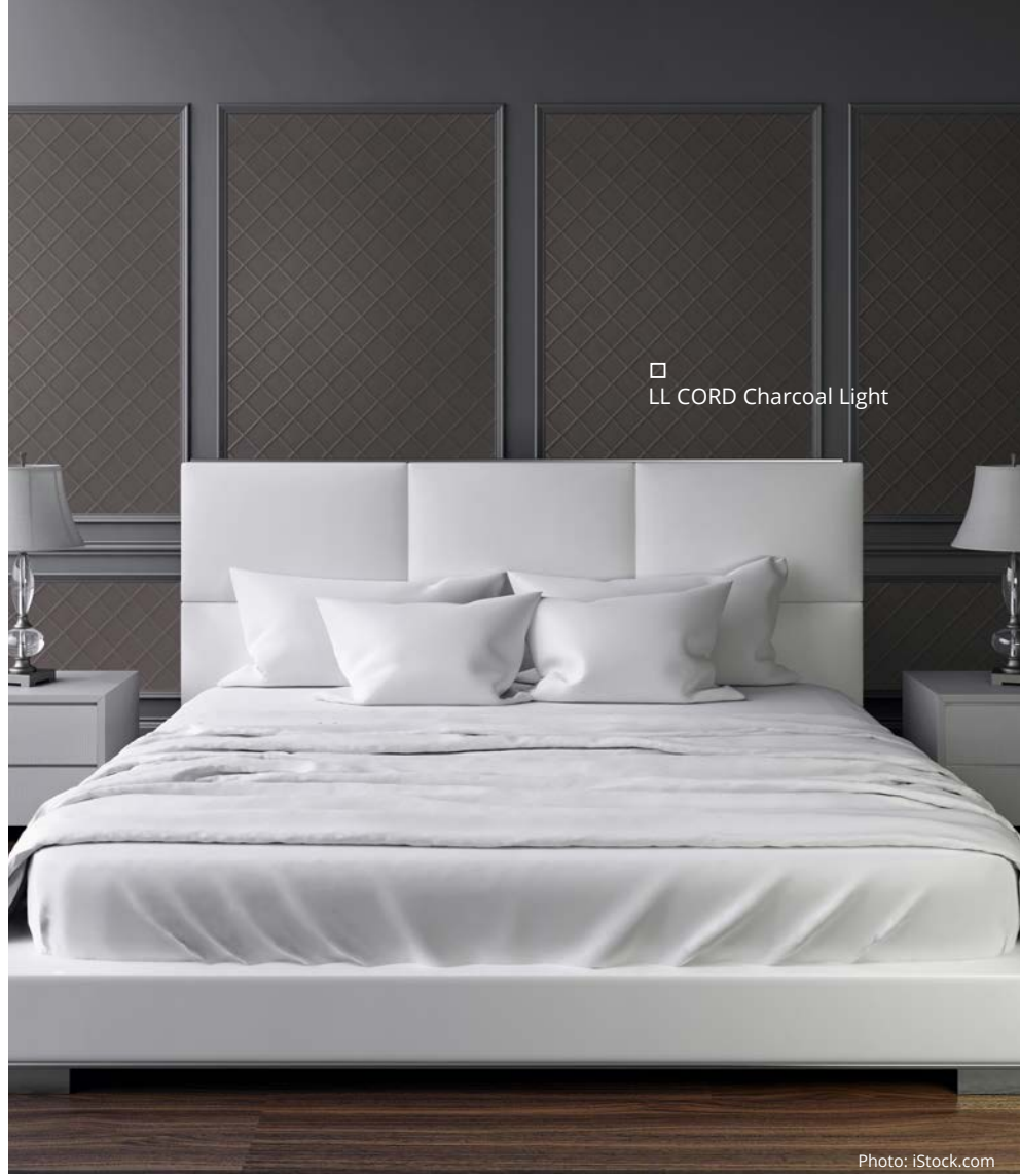
□ LL CORD Charcoal Light