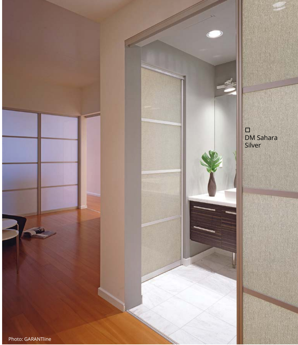
□ DM Sahara Silver