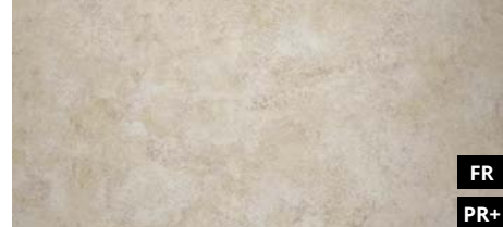
DM Iron Age AR 2600 x 1000 / NA 19201 / SA 19209