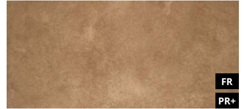
DM Classy Bronze AR 2600 x 1000 / NA 19011 / SA 19022