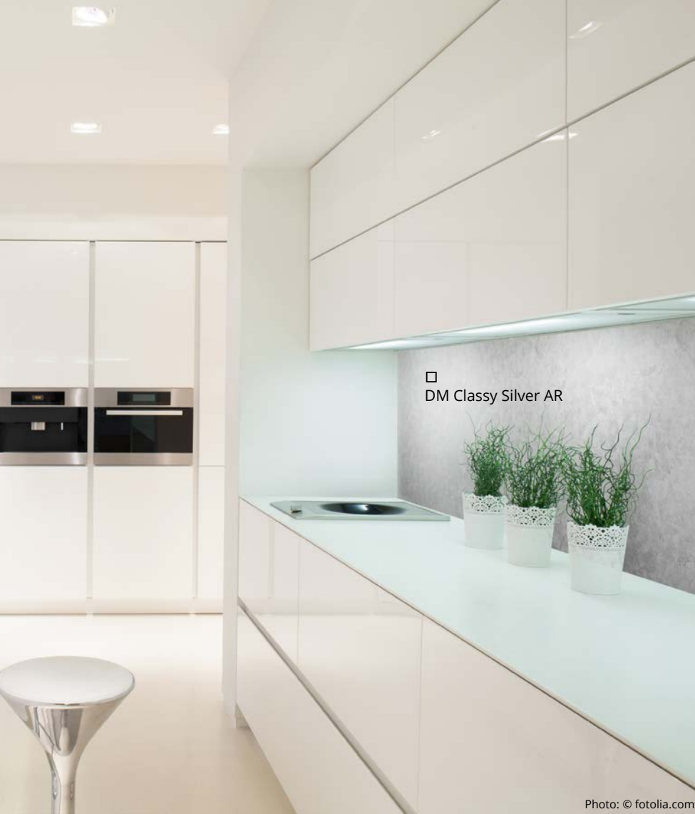
□ DM Classy Silver AR