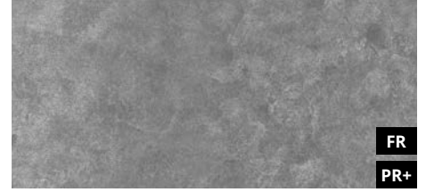
DM Classy Silver AR 2600 x 1000 / NA 19326 / SA 19337