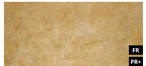
DM Classy Gold AR 2600 x 1000 / NA 19010 / SA 19021