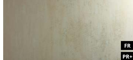
DM METALLIC USED Ivory AR 2600 x 1000 / NA 20149 / SA 20197