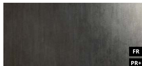
DM METALLIC USED Steel AR 2600 x 1000 / NA 20148 / SA 20196