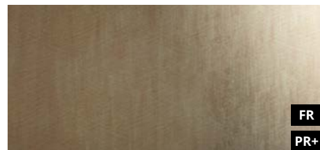
DM METALLIC USED Sand AR 2600 x 1000 / NA 20147 / SA 20195