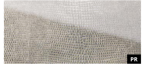
SG LEGUAN Silver AR+ 2600 x 1000 / NA 16975 / SA 16979