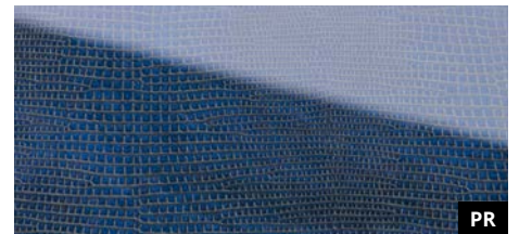
SG LEGUAN Blue AR+ 2600 x 1000 / NA 16978 / SA 16984