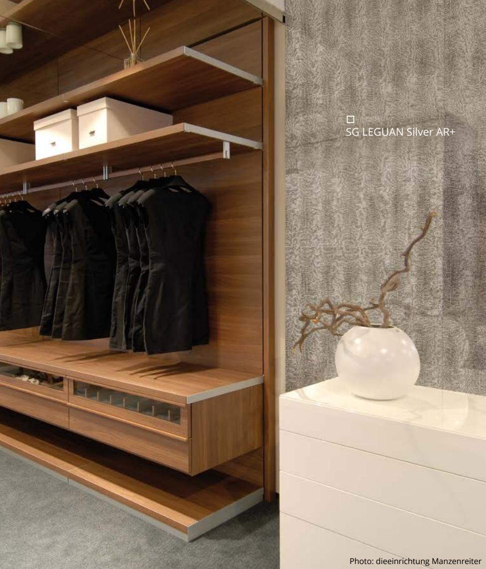
□ SG LEGUAN Silver AR+