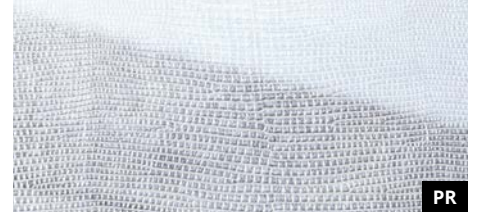
SG LEGUAN Bianco met AR+ 2600 x 1000 / NA 19304 / SA 19305