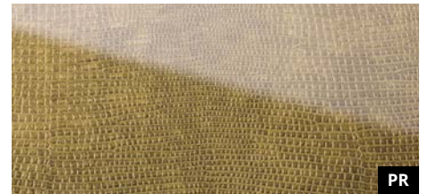
SG LEGUAN Gold AR+ 2600 x 1000 / NA 16977 / SA 16982