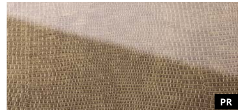
SG LEGUAN Silk AR+ 2600 x 1000 / NA 20275 / SA 20276