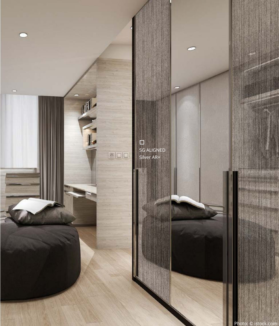
□ SG ALIGNED Silver AR+ Silver AR+