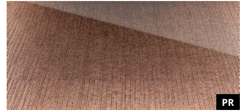
SG ALIGNED Gold AR+ 2600 x 1000 / NA 20179 / SA 20218