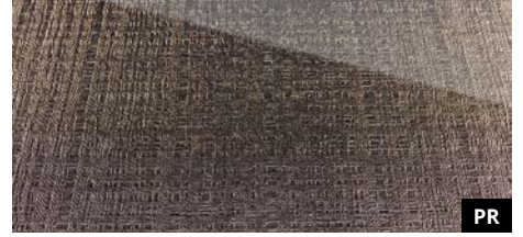
SG GRID Silver AR+ 2600 x 1000 / NA 20183 / SA 20222