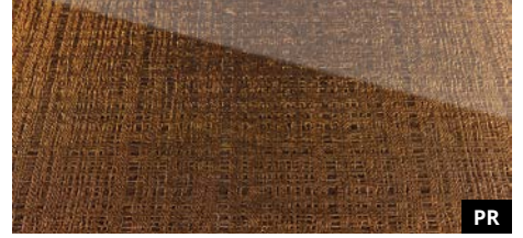
SG GRID Gold AR+ 2600 x 1000 / NA 20182 / SA 20221