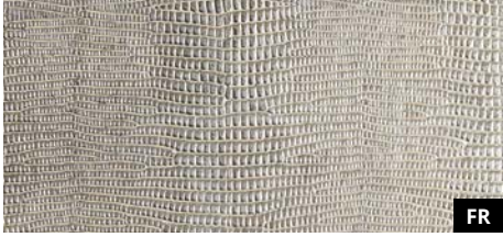
LL LEGUAN Silver 2600 x 1000 / NA 12883 / SA 12893