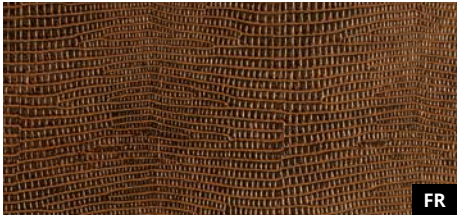
LL LEGUAN Copper 2600 x 1000 / NA 12884 / SA 12894