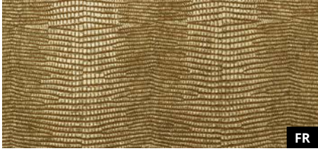
LL LEGUAN Gold 2600 x 1000 / NA 13480 / SA 13478