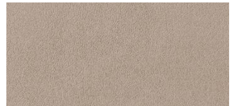
LL Stony Ground 2600 x 1000 / NA 19012 / SA 19023