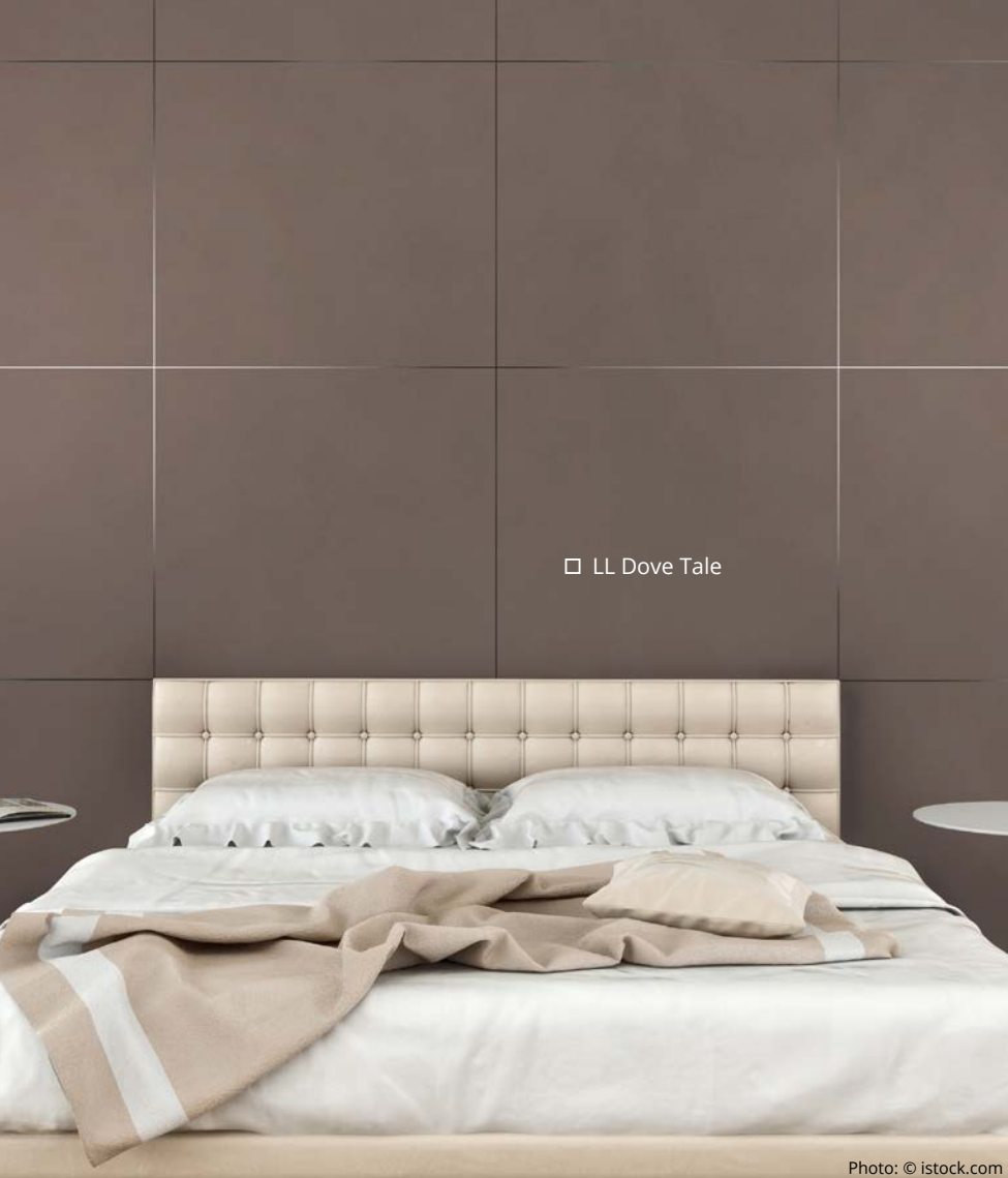
□ LL Dove Tale