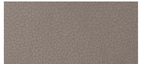
LL Dove Tale 2600 x 1000 / NA 19013 / SA 19024