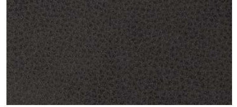
LL Charcoal Dark 2600 x 1000 / NA 19299 / SA 19302