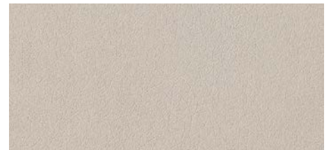
LL Light Oyster 2600 x 1000 / NA 19015 / SA 19026