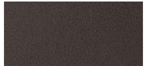
LL London Clay 2600 x 1000 / NA 19014 / SA 19025