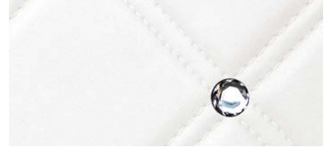
CR CRISTAL ROMBO 85 Bianco matt/Silver 2600 x 1000 / SA 15044