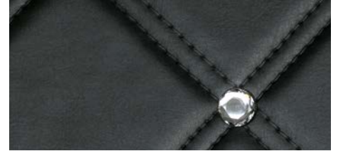
CR CRISTAL ROMBO 85 Nero matt/Silver 2600 x 1000 / SA 15034