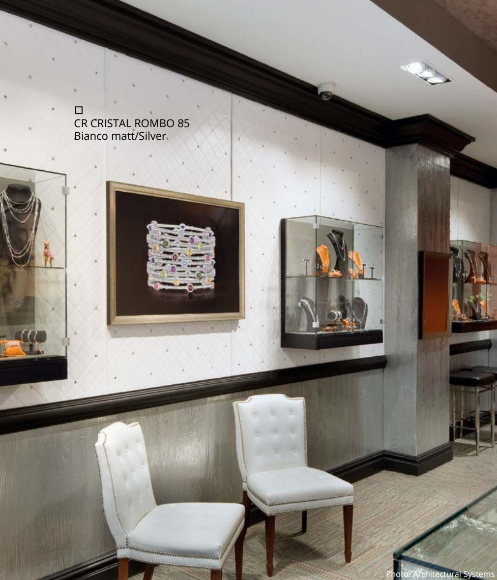
□ CR CRISTAL ROMBO 85 Bianco matt/Silver.