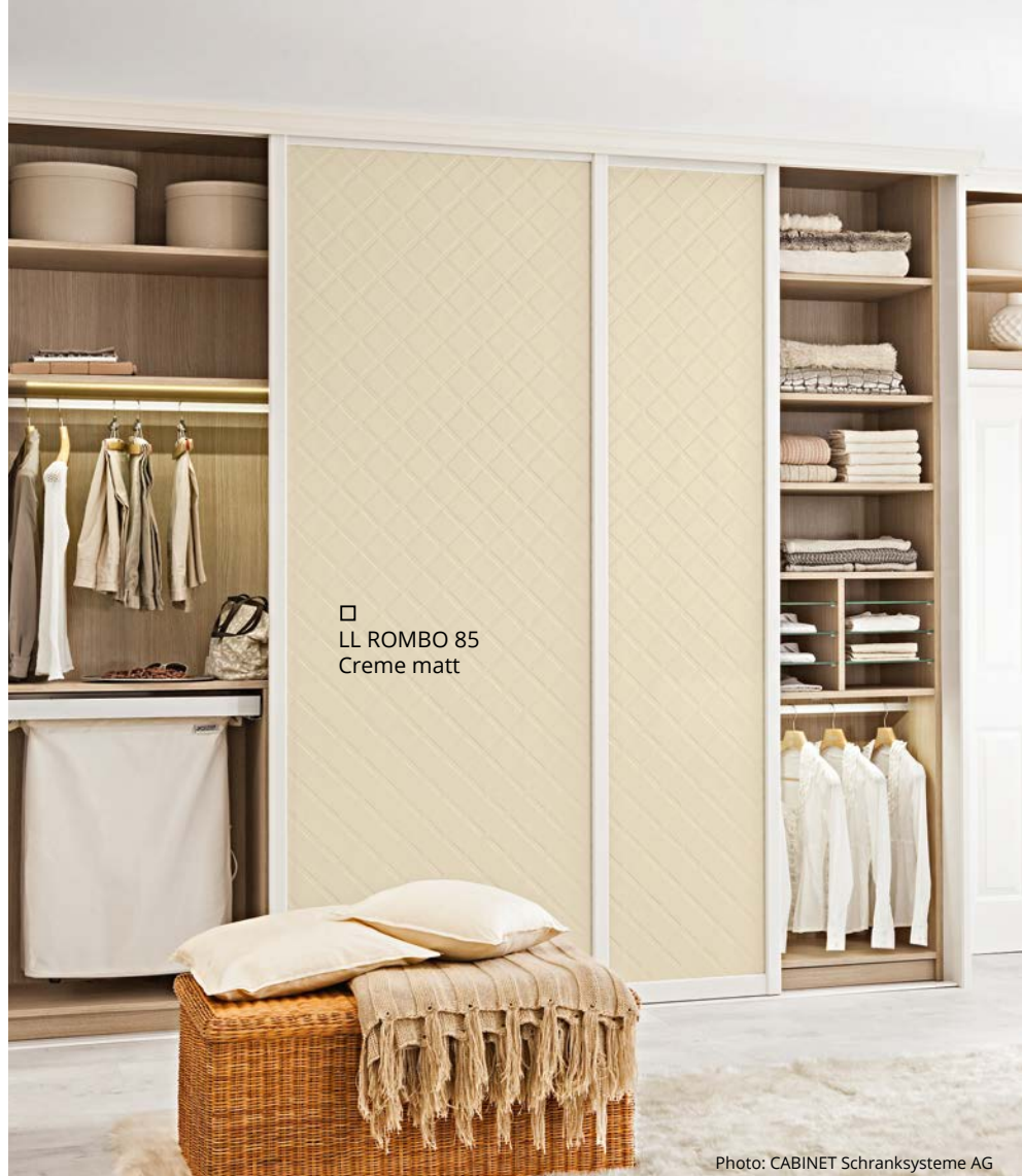
□ LL ROMBO 85 Creme matt