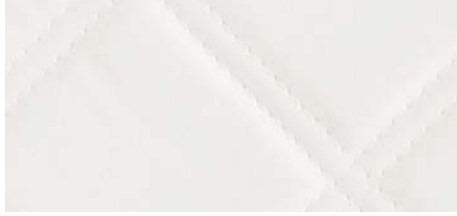
LL ROMBO 85 Bianco matt 2600 x 1000 / NA 15026 / SA 15042