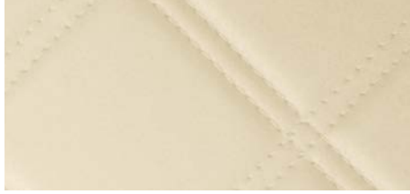
LL ROMBO 85 Creme 2600 x 1000 / NA 13852 / SA 13867