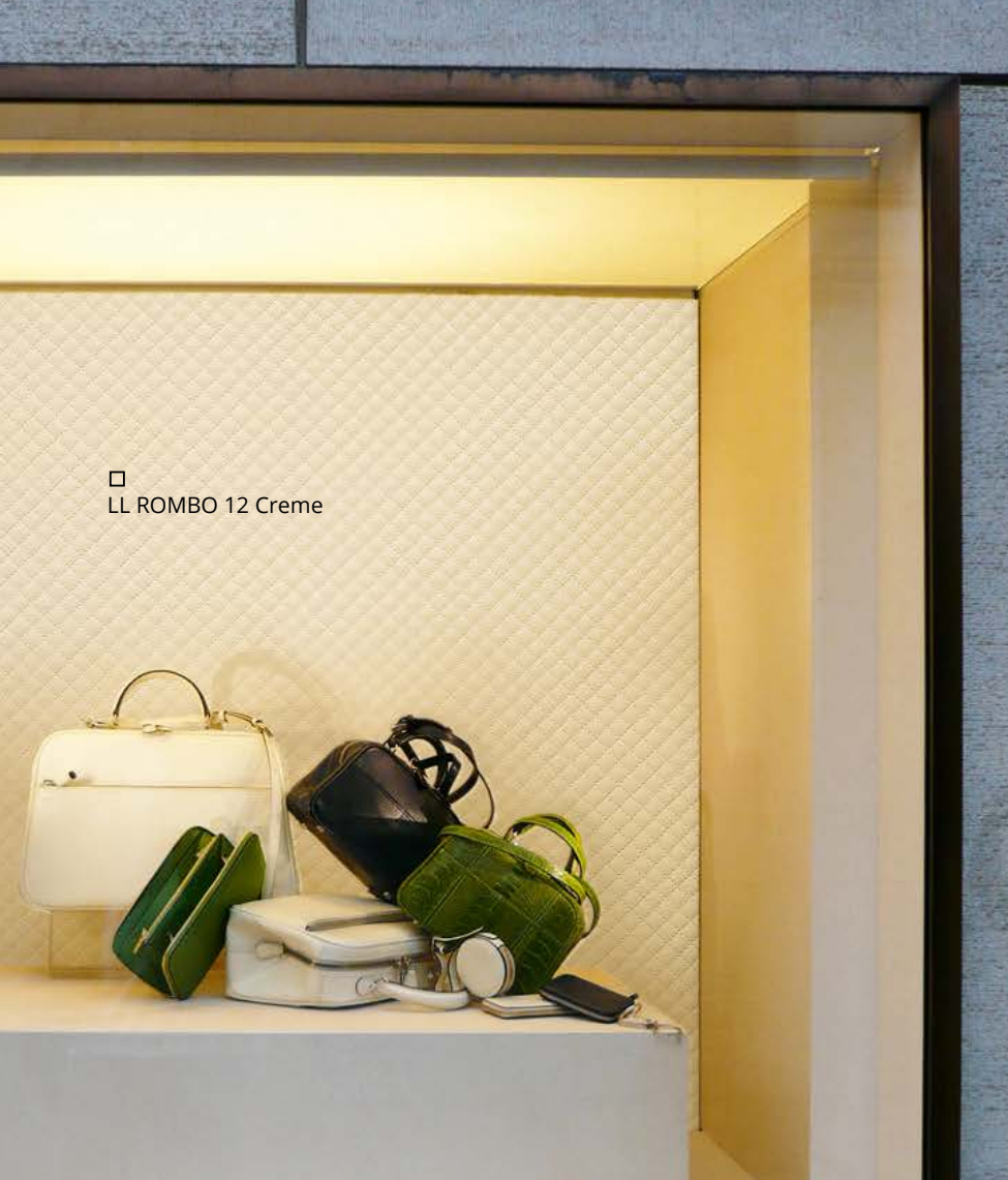
□ LL ROMBO 12 Creme