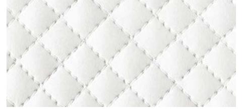
LL ROMBO 12 Bianco matt 2600 x 1000 / NA 16418 / SA 16419