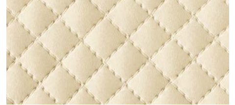
LL ROMBO 12 Creme 2600 x 1000 / NA 15653 / SA 15657