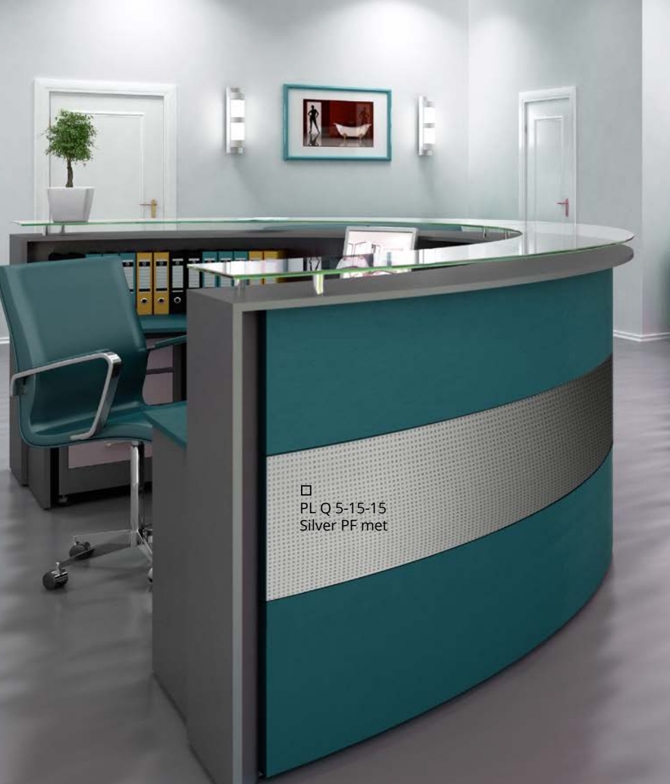
□ PL Q 5-15-15 Silver PF met