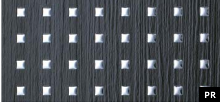
PL 3D Q 5-15-15 Black touch 1/Silver 2600 x 1000 / NA 12384 / SA 12549