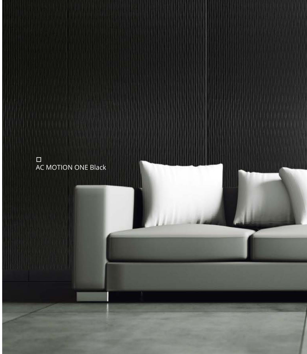
□ AC MOTION ONE Black

2600 x 1000 / 1,2 mm / NA 15936 / SA 15956