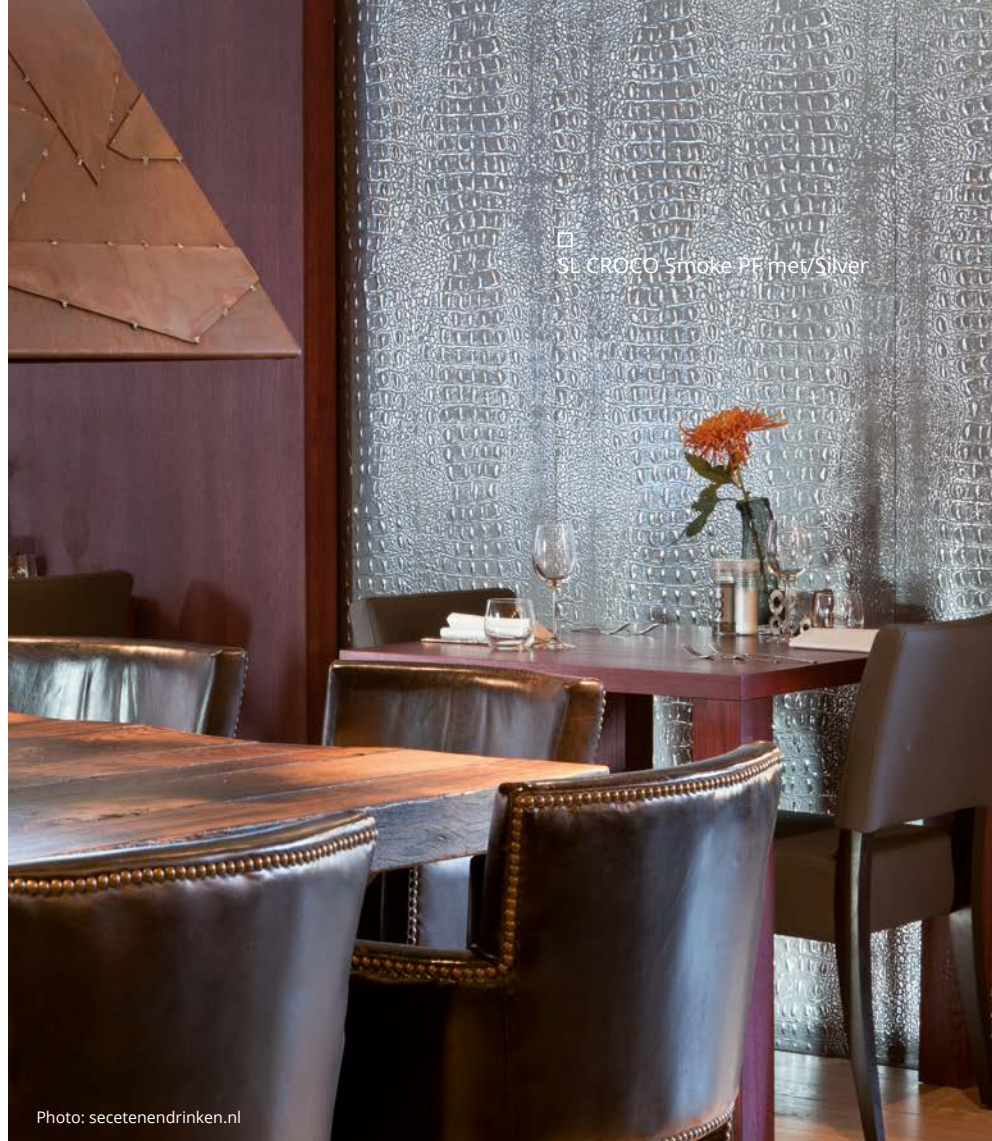
SL CROCO Smoke PF met/Silver