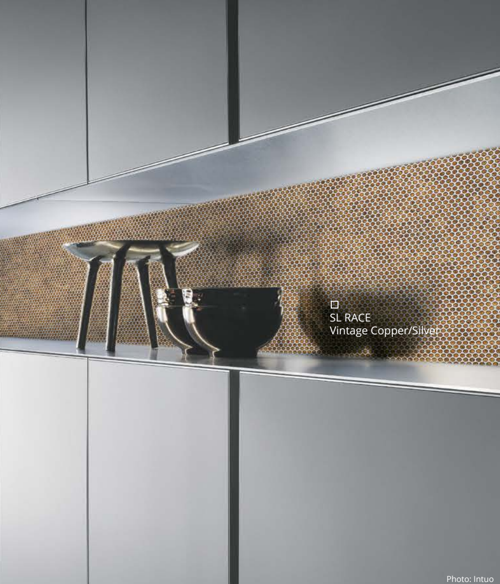
□ SL RACE Vintage Copper/Silver