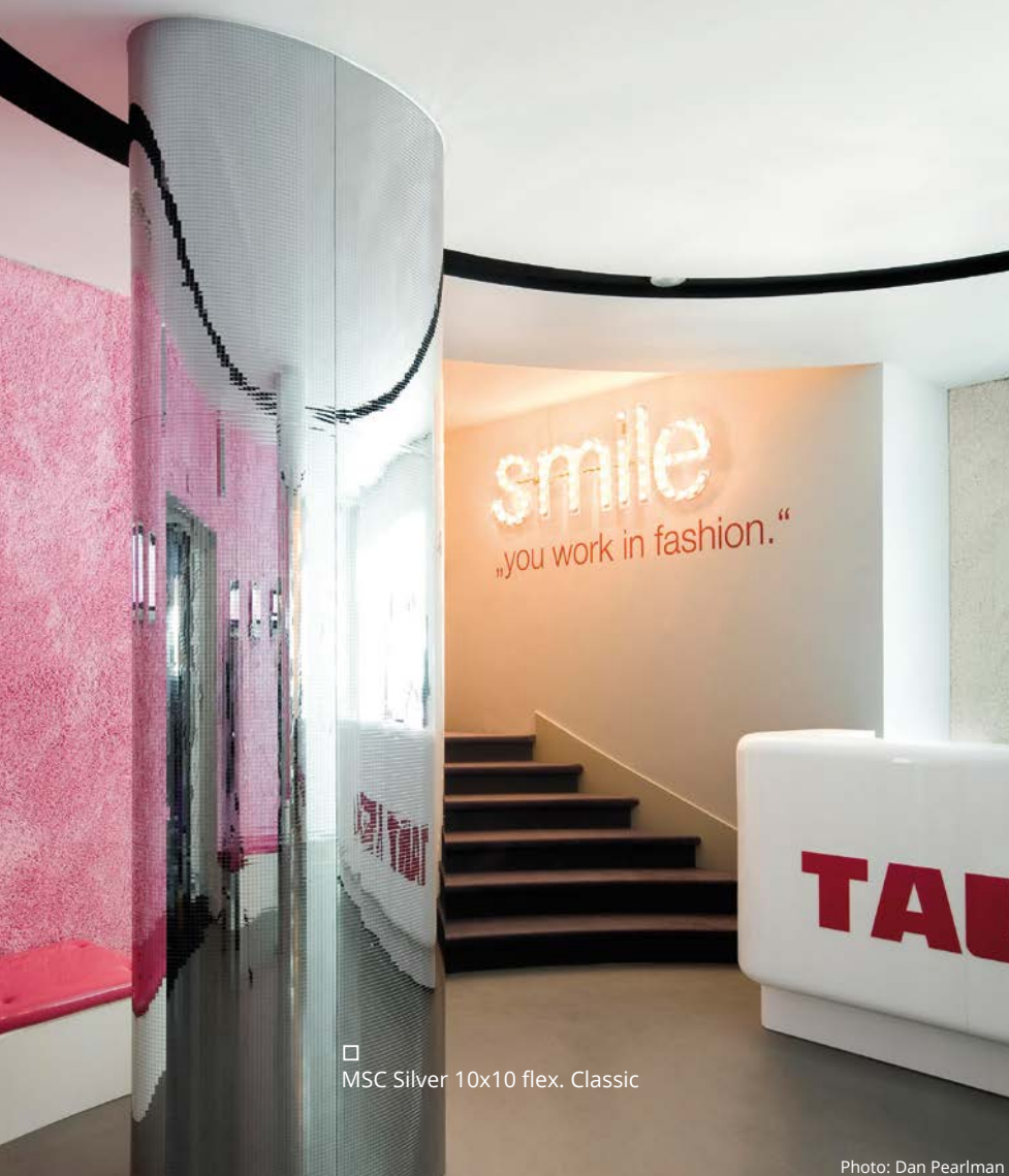
□ MSC Silver 10x10 flex. Classic