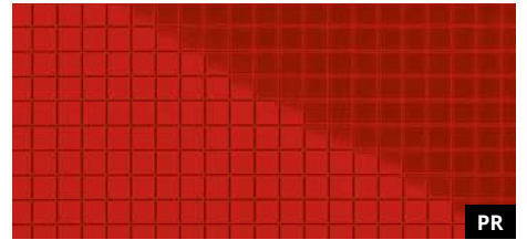
MS Magic Red 5x5 flex. Classic 980 x 980 / SA 13763