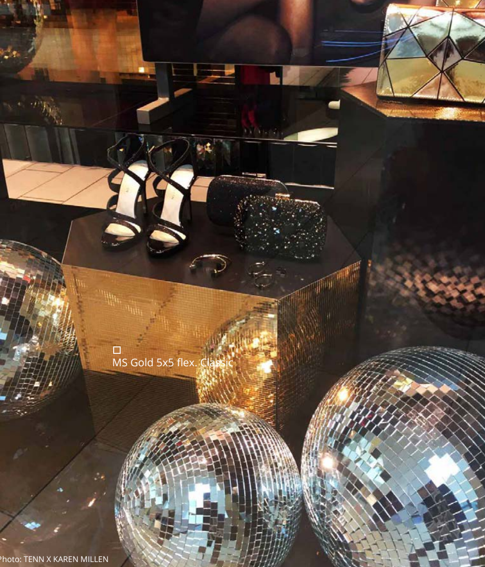
□ MS Gold 5x5 flex. Classic