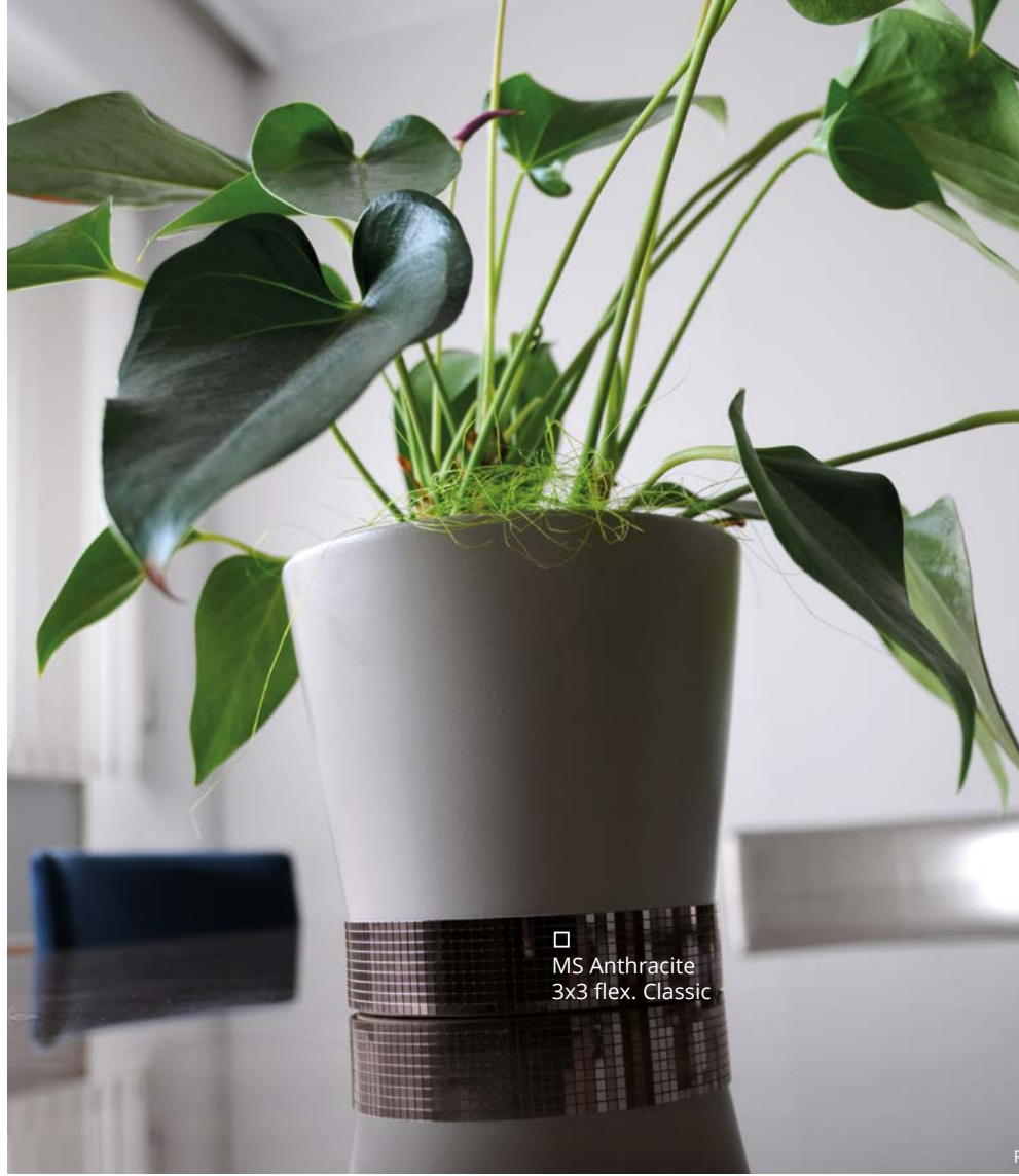
□ MS Anthracite 3x3 flex. Classic