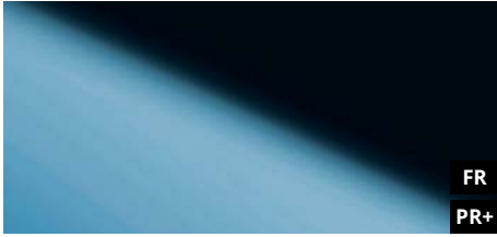
DM Iceblue 2600 x 1000 / NA 10204 / SA 10210