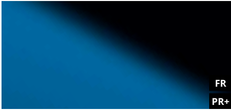
DM Skyblue 2600 x 1000 / NA 10217 / SA 10219