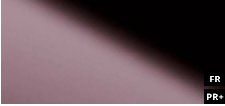
DM Rose 2600 x 1000 / NA 10271 / SA 12428